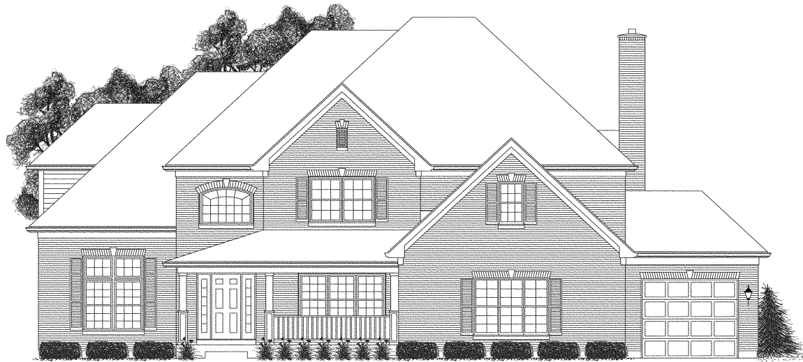
ELEVATION II (OPT. RAILS)