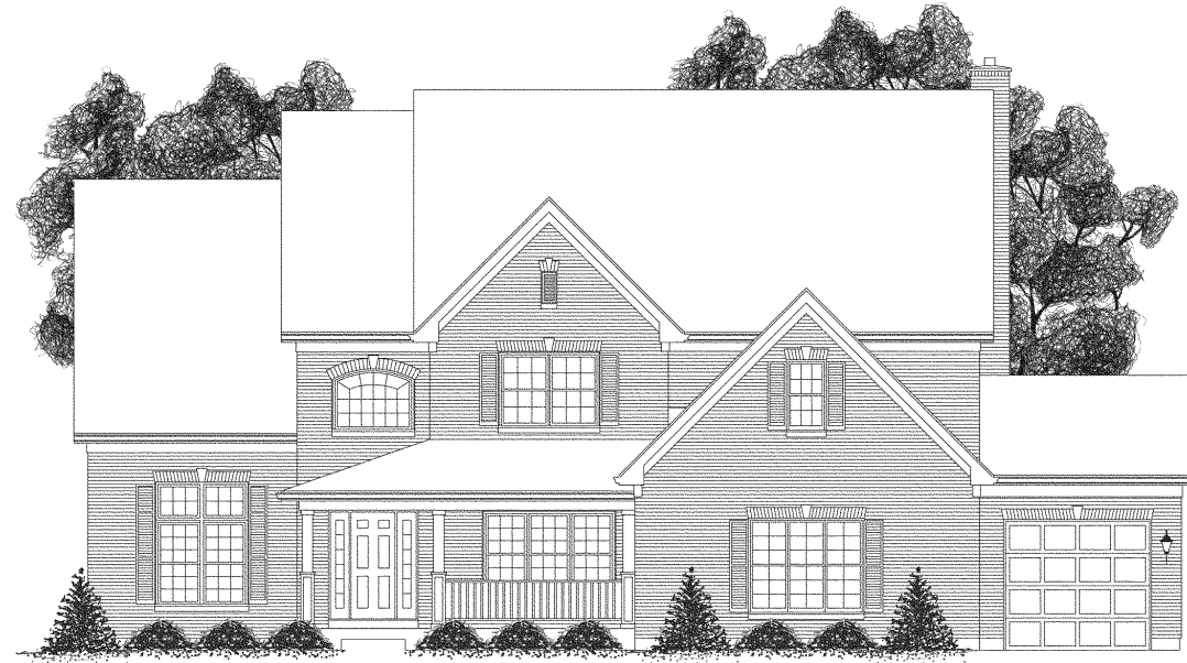
ELEVATION I (OPT. RAILS)