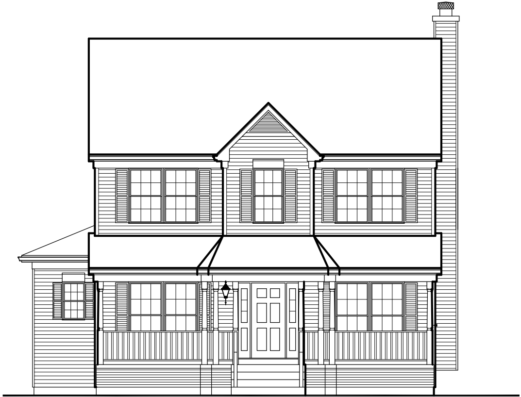
FRONT ELEVATION LOT P-58