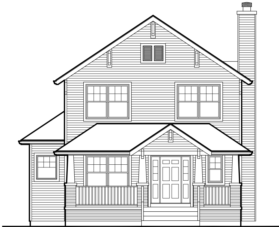
FRONT ELEVATION LOT P-103