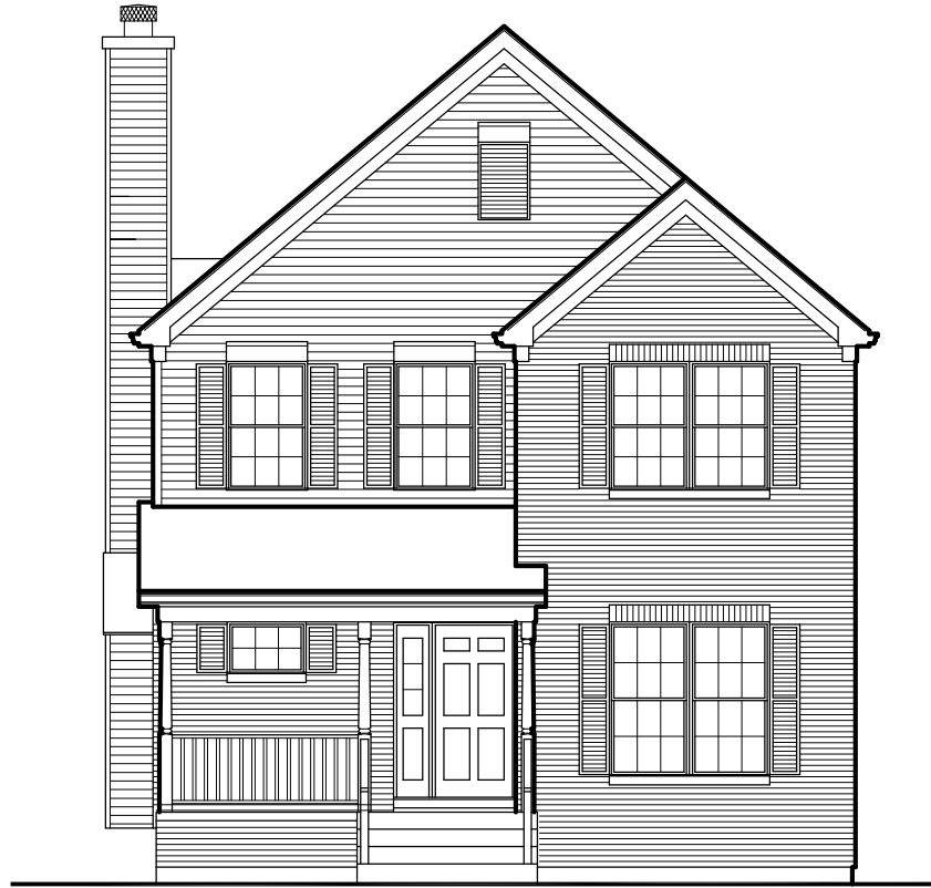
FRONT ELEVATION LOT P-59