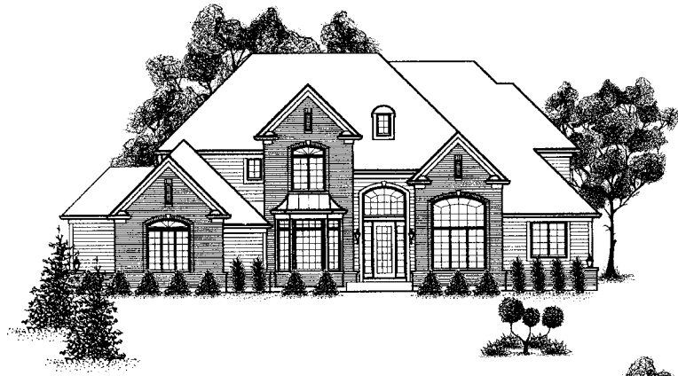
ELEVATION I CEDAR SIDING W/ BRICK ACCENT (OPT. DORMER)