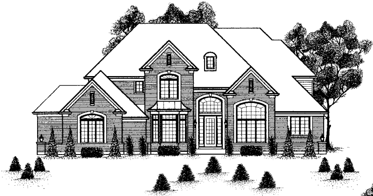
ELEVATION IV BRICK FRONT W/ STONE ACCENT (OPT. DORMER)