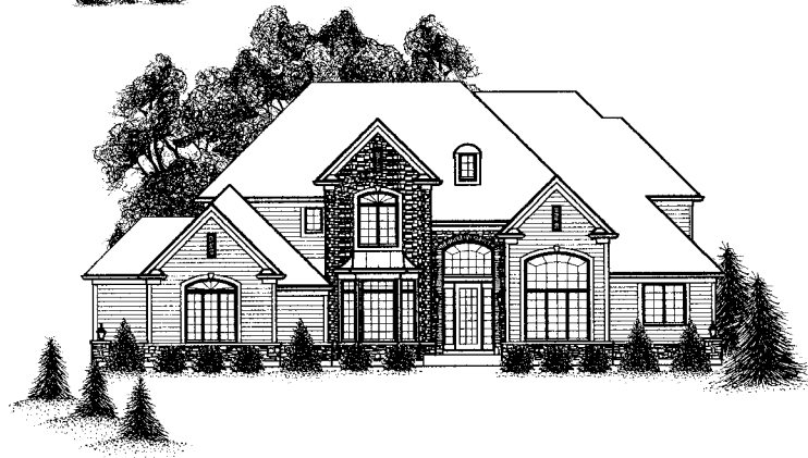
ELEVATION III BRICK FRONT (OPT. DORMER)