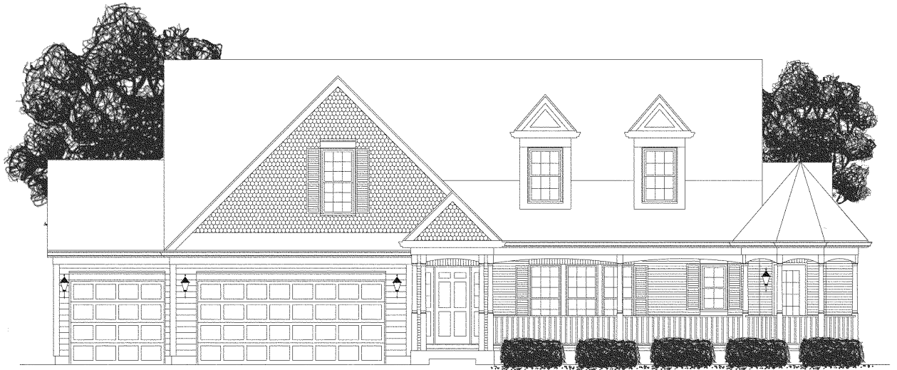
ELEVATION I (OPT. DORMERS)