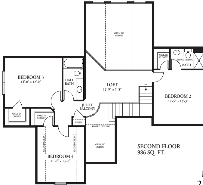
SECOND FLOOR 986 SQ. FT.