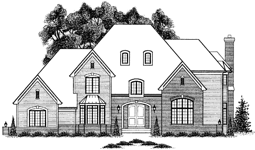
ELEVATION I BRICK W/ SIDING, TURRET COPPER ROOF (OPT. FIREPLACE, 4-CAR GARAGE, & DORMERS)